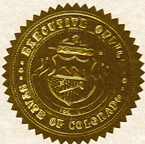
Jared Polis Governor

GIVEN under my hand and the Executive Seal of the State of Colorado, this twelfth day of September, 2020